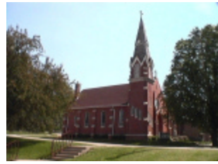
ST. MARY CHURCH Guthrie Center, IA