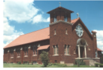
ST. PATRICK CHURCH Bayard, IA