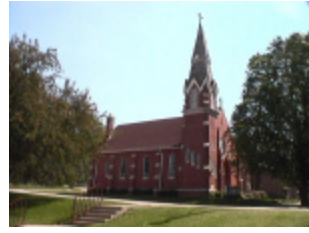
ST. MARY CHURCH Guthrie Center, IA