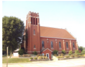
ST. CECILIA CHURCH Panora, IA