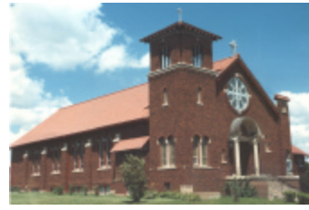
ST. PATRICK CHURCH Bayard, IA